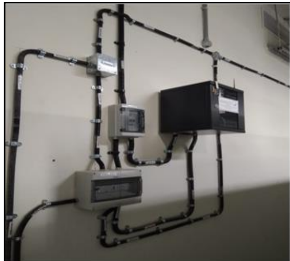
Reference # 2