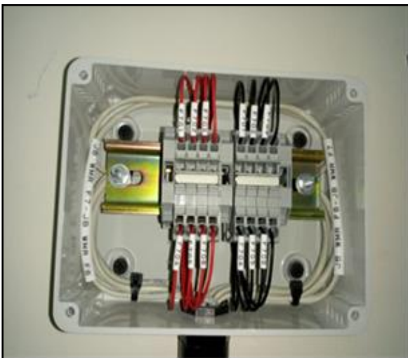
Reference # 1