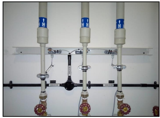
Reference # 1