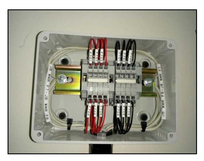
Reference # 3