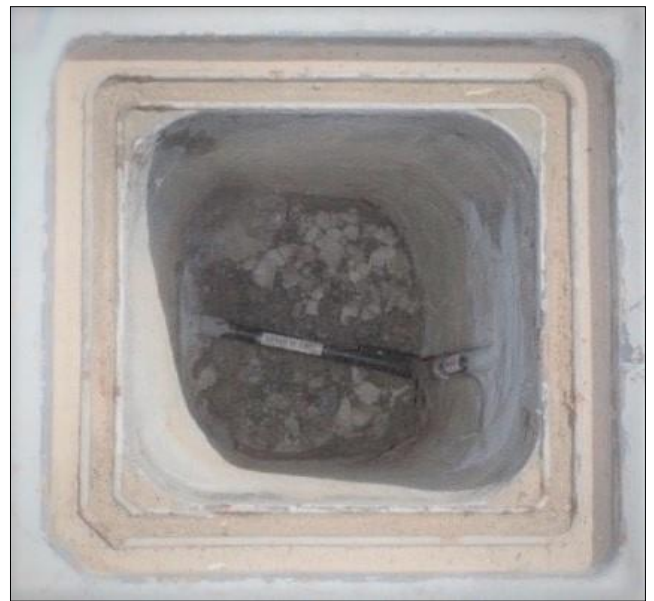
Reference # 1