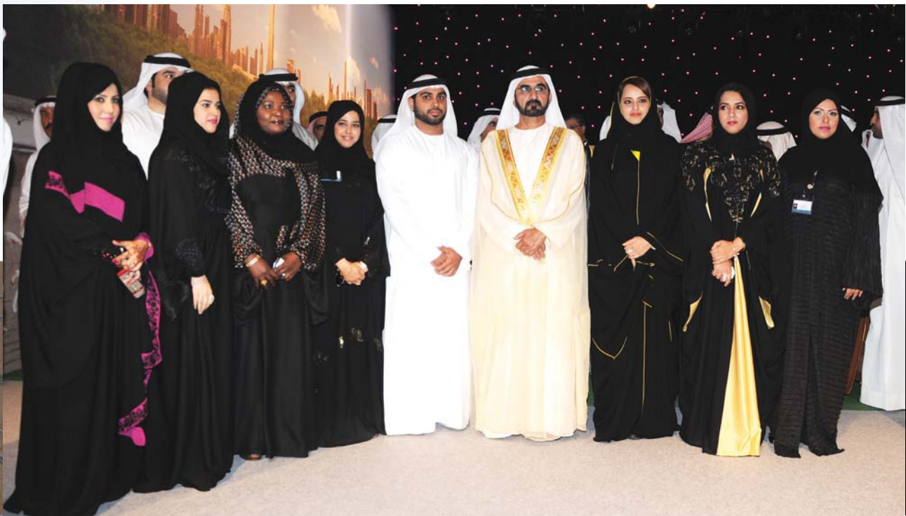
► HH Sheikh Mohammed bin Rashid with a group of DEWA employees.