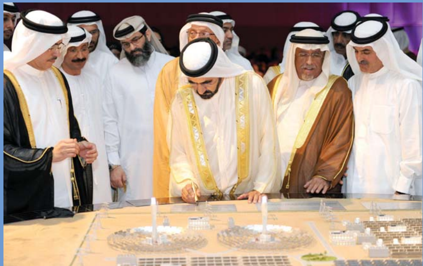
► During signing on the model of the project

"Dubai has made great and unprecedented achievements, which has made it one of the world's most competitive countries. This prominent position is the culmination of the efforts of our leadership to create a stimulating business environment, characterized by a cutting-edge and robust infrastructure and world-class, efficient and reliable services. These services have greatly