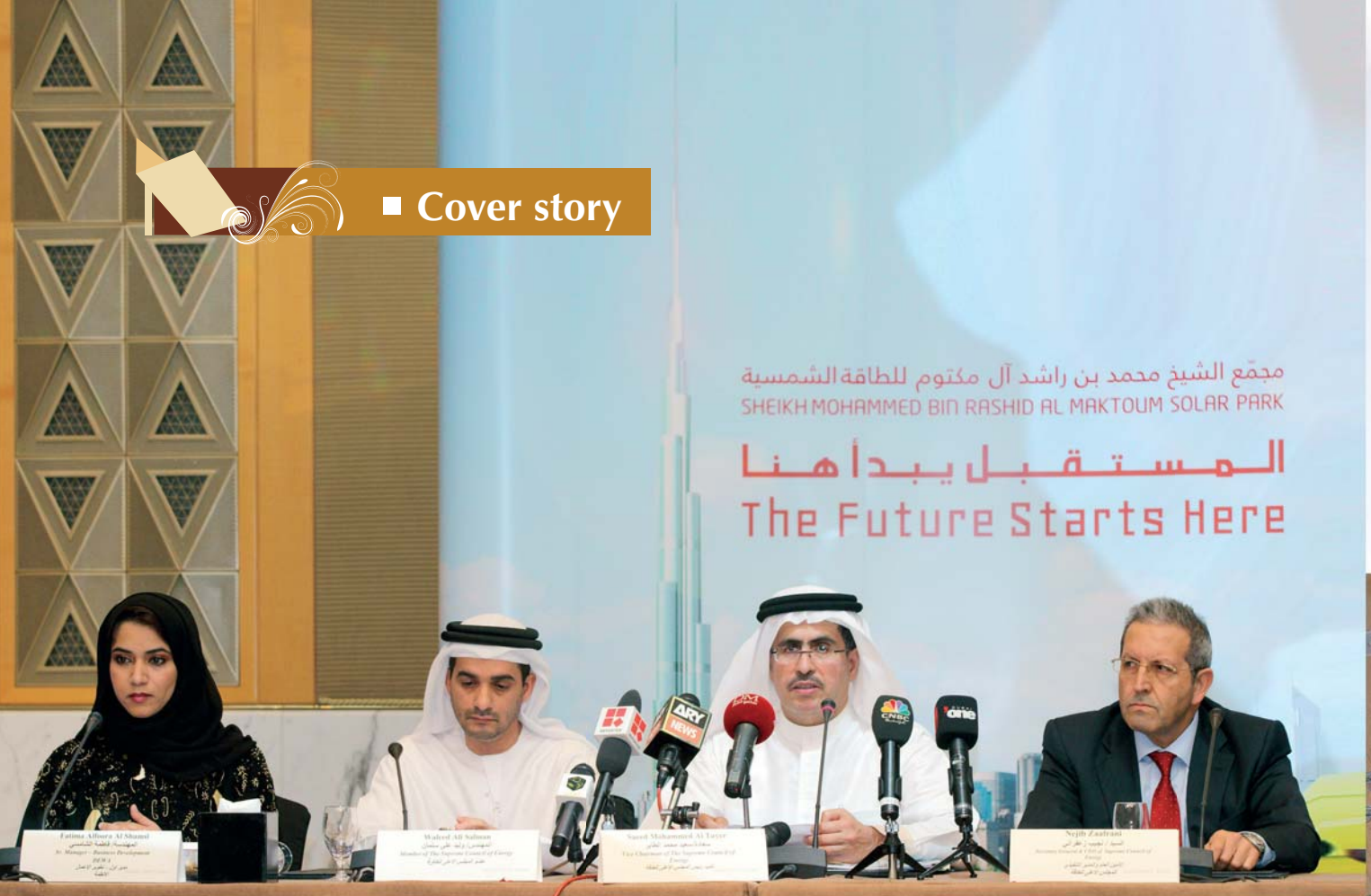
► During the press conference

low cost of kilowatts per hour from 120 fils in 2004 to 70 fils in 2012 by 48%. This has led to the consideration of increasing solar energy's proportionate output.