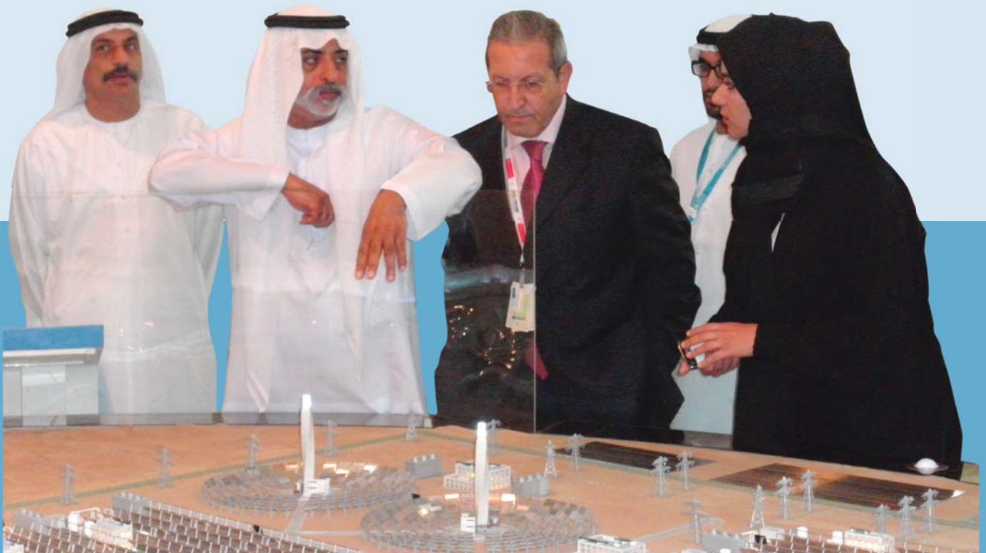
HH Sheikh Nahyan bin Mubarak AL Nahyan, minister of Education, while listening to an explanation on the model of Mohammed bin Rashid Al Maktoum Solar Park from Fatima Al Shamsi

HE Mitsuyoshi Yanagisawa praised Dubai’s position as a hub for trade, business and logistics. “Japan is working on reestablishing its infrastructure after the earthquake and is reviewing its energy policy based on four pillars, which are: strengthening energy conservation, promotion of renewable energy, clean utilization of fossil fuels and reducing dependence on nuclear power. We look forward also to maintaining our long-term long term partnership with the UAE government,” said Mr Yanagisawa.