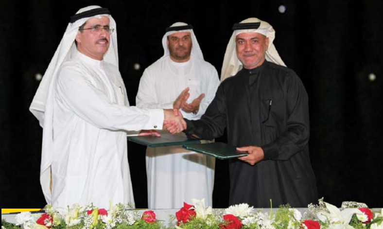
Signing an MOU with Awqaf & Minors Affairs Foundation